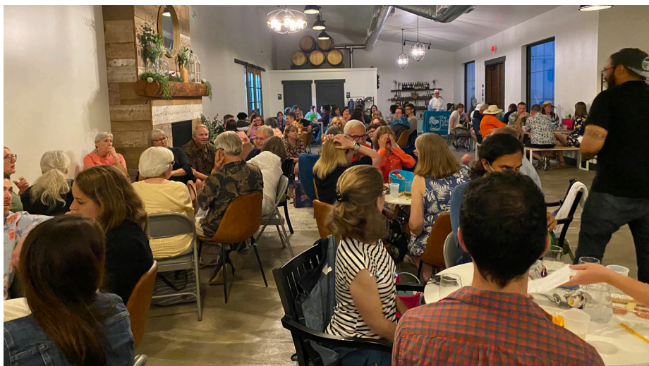
A packed house last year helped us raise $2,000 for the library - let's do it again this year!